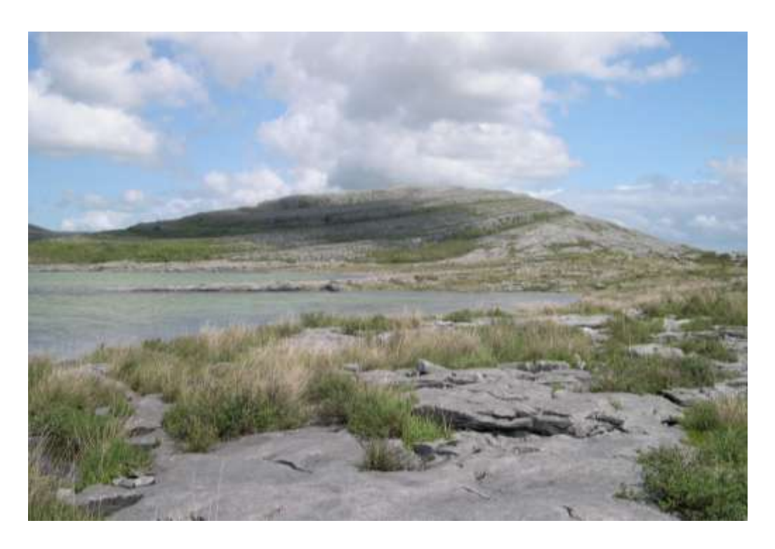
Mullaghmore - the Heart of the Burren

So let me go and make my name there And give me one last smile. I swear that when I do return I will do so in great style; I swear that when I do return I will do so in great style, It's to the Priest we both will go, Then we'll walk down the aisle.