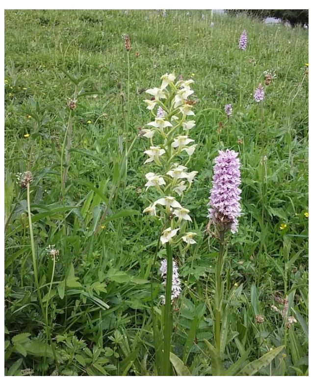
Orchids at Argill Nature Reserve in Westmorland

I spend a lot of time looking out for wild flowers, but, increasingly, fail to find them in our farmed landscape despite this comprising about 70% of the UK. If the present rate of decline continues, there will come a time when The Last Flower dies.