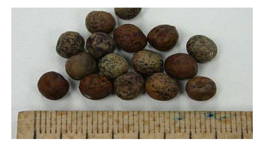
Black Peas - the reality!

Please see The Black Pea Man for full explanation!