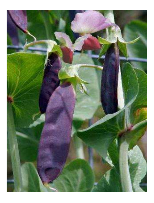
Pisum sativum var. arvense

Of course, I'm thinking black peas here, sometimes known as carlins. Pigeons rather fancy them, but they are eschewed by starlings. If you eat these peas you'll finish up as strong as Hercules, Rely on pink-petalled, purple-podded, parching peas; That's pink-petalled, purple-podded, parching peas.