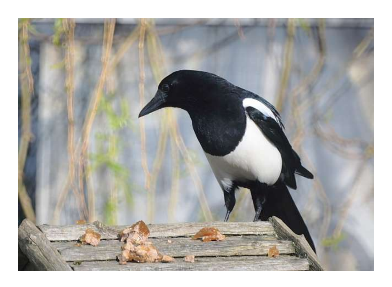
Magpies are handsome and intelligent birds, but they are not popular with all given their predilection for other birds' eggs. Why they have become such a part of British folklore, I do not know.

If you should see seven magpies in the sky, Flying low, flying high , If you should see seven magpies in the sky Then into others lives don't ever pry.