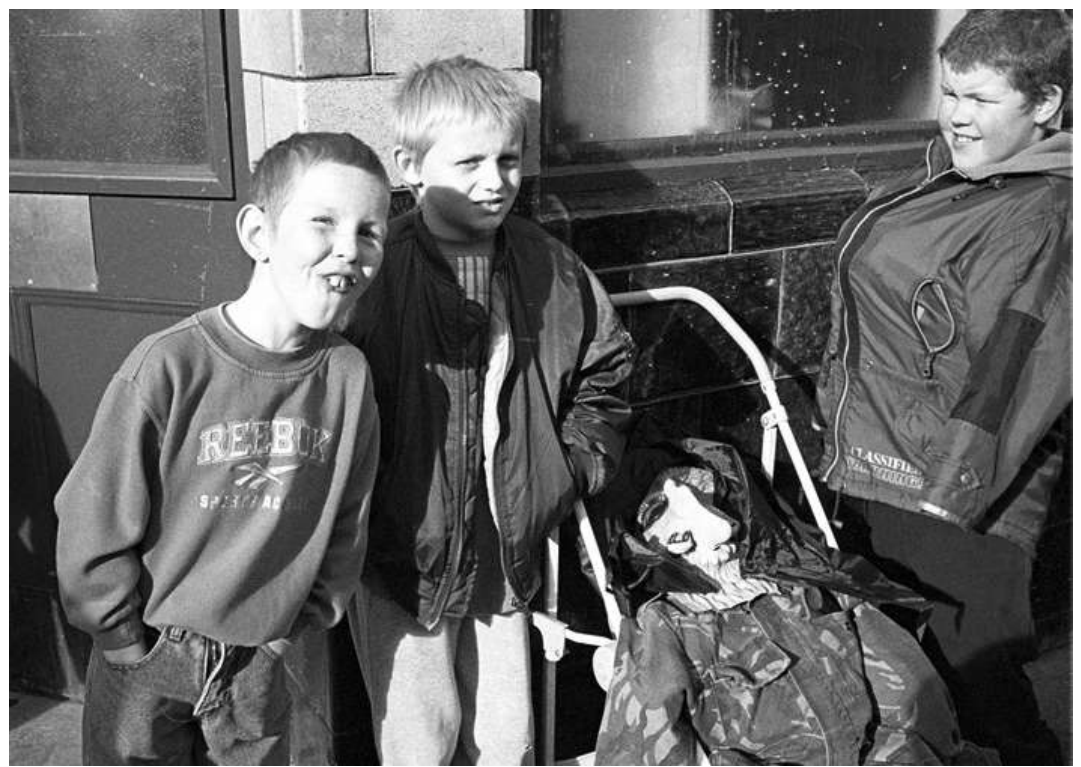
but which one is the Guy?

Of course, Bangers were what we really wanted to buy, but I couldn't fit them into the song! The Banger par excellence was the Cannon, but it cost 2d. Put one of those in a tin, and it really did blow it apart. Jumping Jacks were brilliant for scaring the girls. They were a tube of gunpowder shaped like a concertina. Once dropped on the ground, they bounced and banged all over the place, causing the meek to flee. On reflection, it was a good idea to run, as dresses and short trousers gave no protection from fireworks. I don't think you can buy either Cannons or Jumping Jacks nowadays - and it's probably just as well!