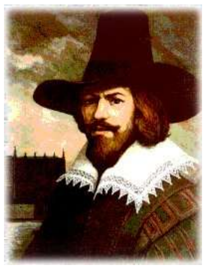
The original Guy